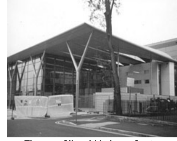
The new Clissold Leisure Centre

Writing in Stoke Newington's N16 magazine, Ken Worpole reported that "although most of the building work is now completed, there are apparently still problems in controlling the quality of water black algae has been seen on test runs and a large glass screen in the entrance foyer is causing problems in getting a fire rating. But even when these details are solved – and the taxi meter keeps ticking away, clocking up tens of thousands of pounds every month - final decisions have still to be made about the running of the centre, and what pricing and programming policies are to be adopted."