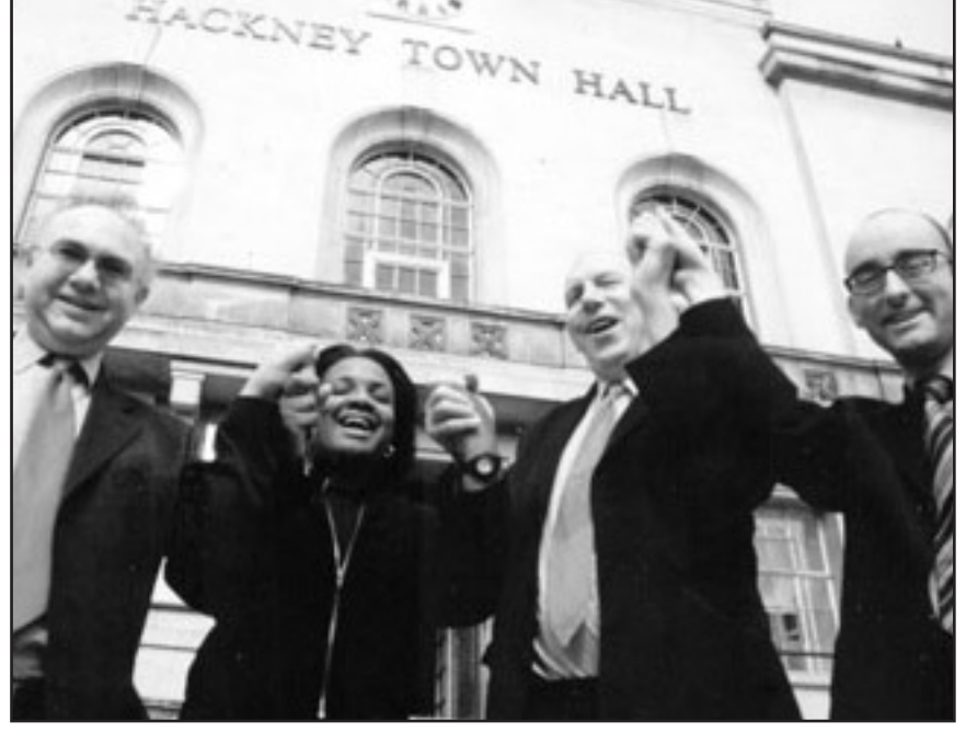
Two Labour MP's and two new Labour councillors were elected on June 7th. Let's try and wipe the smug smiles off their faces in next May's local elections.

ing flats for rich people and promoting the "nighttime economy" more trendy bars and restaurants in Hoxton Square and Curtain Road. Did you vote for that? There was a time when Labour was criticised for only coming round at elections. Now they and the other parties don't even do that. Labour can no longer claim to represent working class interests - in fact it has not even tried to do so for years.