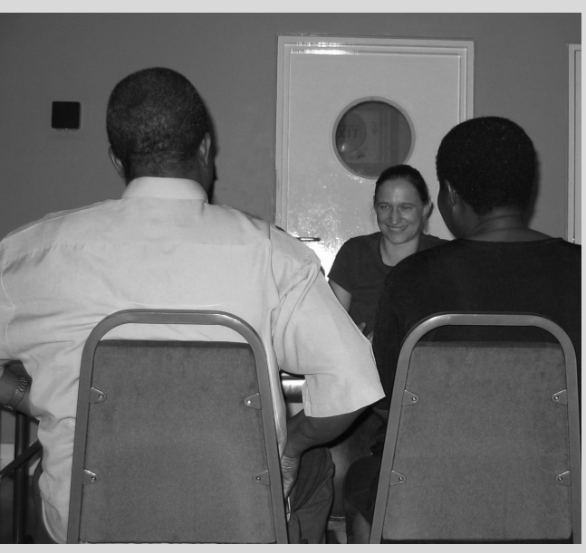
Hackney Independent member helping Hoxton tenants with repair problems at the last advice surgery.

Thursday 7th April 6.00-7.30pm Geffrye Estate Community Centre